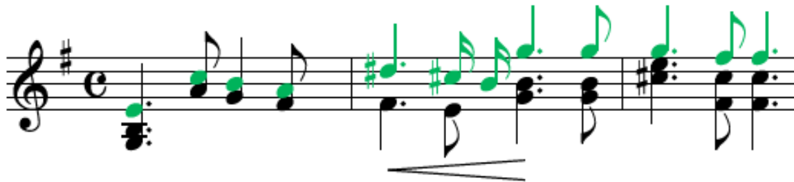
Fig. 1. Sample OMR output from Händel's "Der Messias: Oratorium"